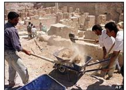
Iraq has long been the site of some of the most important historical finds